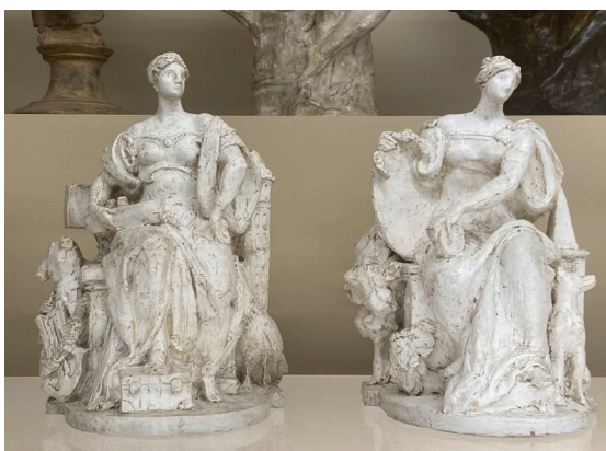
Maquettes for Manhattan , 1914 and Brooklyn , 1914, Manhattan Bridge Groups, plaster