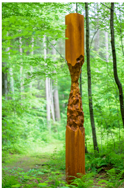
Rumination by Jonathan Prince along the woodland walk

Elemental Matters: The Sculpture of Jonathan Prince remains on view throughout the grounds at Chesterwood through October 24 th . Visitors have come away impressed by how the natural beauty and cultivated landscape at Chesterwood intersects beautifully with Prince's work, crafted in CorTen and stainless steel, with multifaceted, shining surfaces that reflect the outdoors so effectively that art and world seem to meld into each other. Prince's work challenges the visual boundaries between solid and liquid forms, suggests ancient or futuristic relics, and evokes humanistic emotional and physiological states. Come visit and ponder compelling questions over the physicality of materials, and the symbolism within abstraction.