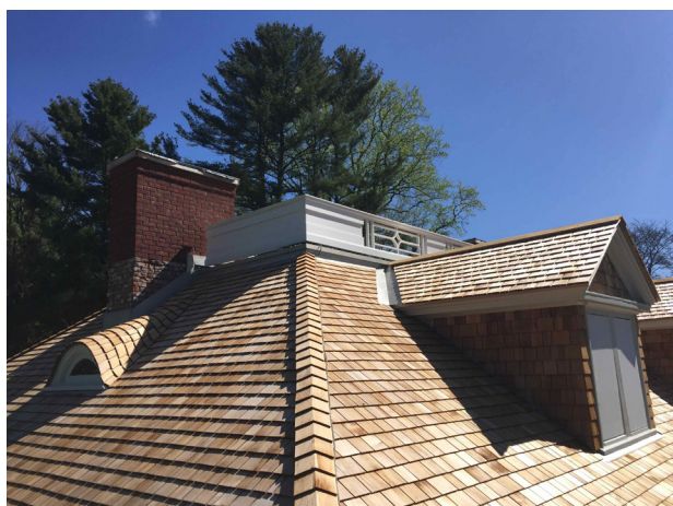
Completed: new cedar roof and decorative trellis on the residence

This spring and summer marked immense progress in the third phase of the rehabilitation of the historic 1901 residence. With the first two phases complete (exterior stucco work and upgrades to exterior utilities), this phase completed the rebuilding and stuccoing of the chimneys, new cedar shake roof tiles, the complete abatement and renovation of the basement - new concrete floor, new walls with water deterring drainage, new water tank, new elevator shaft to second floor - to name a few of the modern safety and access improvements. The basement is now prepared to become a much-needed climate-controlled collections storage area for paintings and sculpture as well as a place to hold the Chesterwood institutional archives and accommodate researchers. While the residence had to be completely emptied and closed to the public during the renovation, we are on track to bring the historic rooms on the main floor back for viewing by next July.