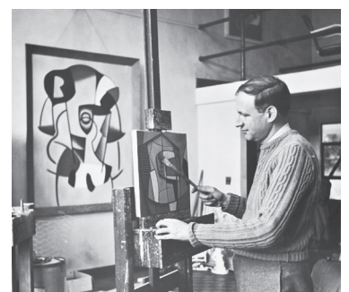
George L. K. Morris