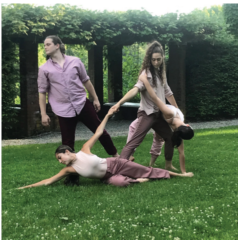
The Young Choreographers Initiative performing in the garden in June 2021

The Young Choreographers Initiative from the Berkshire Pulse Performing Arts Center kicks off our series of outdoor programs on June 30th at 5:00 p.m. Tickets and the full Arts Alive! schedule of readings, dance, and music are at Chesterwood.org/calendar .